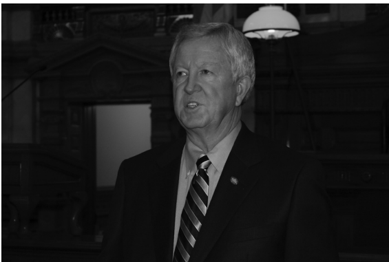
Senate President Steve Morris addresses a news conference in the Senate Chamber during the 2008 Legislative Session.